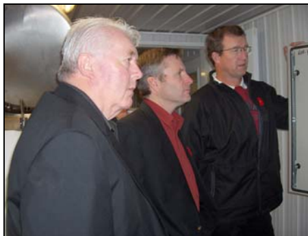
Members of the committee tour an oilseed extraction plant.

The committee also continued its review of the implementation and potential impact of a province-wide ban on the use of cosmetic lawn pesticides, submitting its recommendations to the Legislative Assembly on April 22, 2008. Throughout the public consultation phase of the committee's consideration of this topic, a great deal of public interest was evident, with a total of 227 submissions received from groups and individuals. Additionally, on two occasions, committee members participated in tours, visiting an oilseed extraction facility and a cranberry bog to observe the start of the harvest.