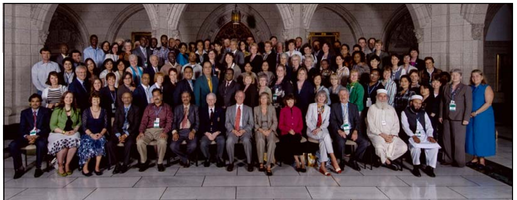
International delegates to the 24th Annual Conference of Library and Research Services to Parliamentarians.

As the library continues to add to its collection and to the professional development of its staff members, I look forward to the dynamic future of the Legislative Library of Prince Edward Island.